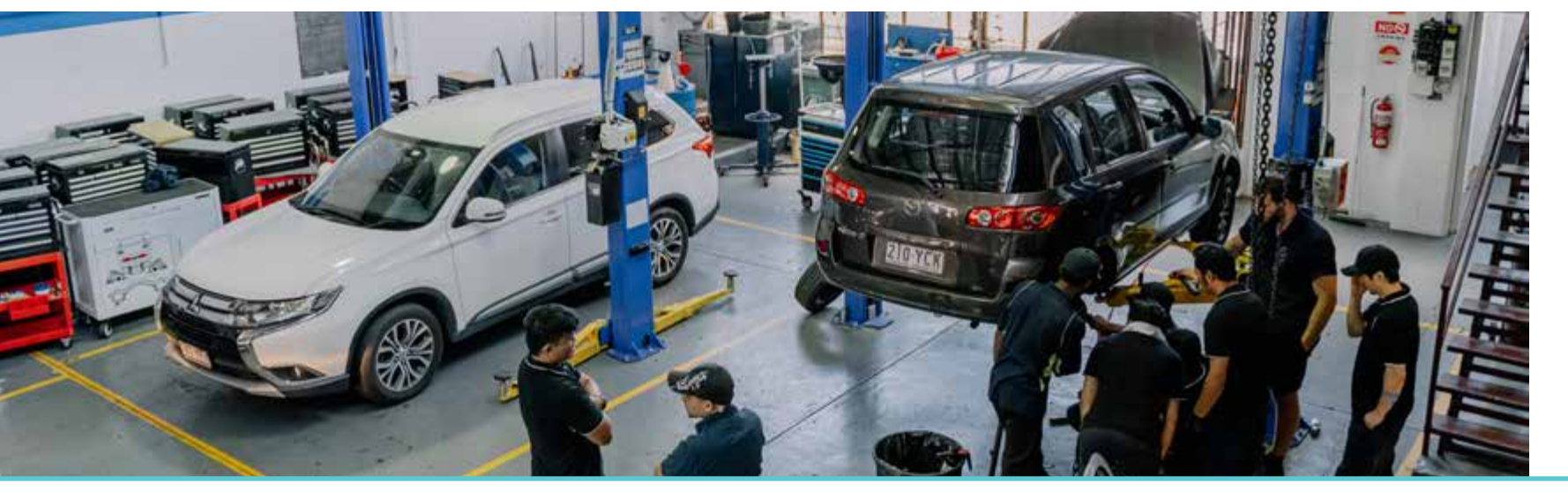
FULLY OPERATIONAL AUTOMOTIVE WORKSHOPS EQUIPPED WITH THE LATEST TECHNOLOGY AND SCAN TOOLS