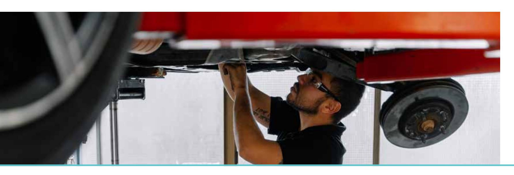
STUDENTS WORK ON REAL CARS IN A REAL-WORLD ENVIRONMENT

REGULAR SEMINARS WITH THE LATEST TOOL SUPPLIERS AND MANUFACTURERS SO OUR STUDENTS CAN STAY AHEAD OF THE REST